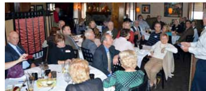
Excellent turn out for the meeting and awards