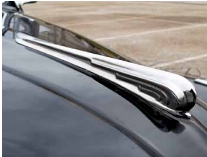
Buick's hood ornament is highly stylized and streamlined, looking to the future

This 1941 Cadillac 60 Special originally cost $2265, so you can see why Cadillac brass was so unhappy with Buick's Limited. It weighs 4230 pounds and a total of 4101 60 Specials were built in 1941, making it fairly rare in terms of overall production. This one includes the new-for-1941 Hydra-Matic 4-speed automatic transmission, an AM radio with power antenna, and a windshield washer system, all of which were optional extras.