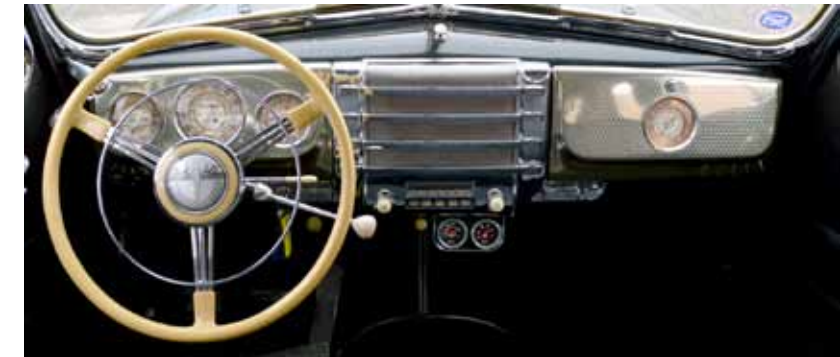
Dashboards: Cadillac top, Buick bottom (auxiliary gauges under Buick's dashboard are not original)

The leather upholstery is comfortable and supportive thanks to the rather recent restoration and all the materials and patterns are quite correct. There is some argument that the dashboard should be woodgrained instead of black, but factory engineering documents indicate that the limousines didn't get the handsome dash treatment because it was for the chauffeur's eyes only. The large plastic steering wheel makes even this giant car easy to handle and it's nice to see that Buick treated the driver to the same wonderfully ornate engine-turned