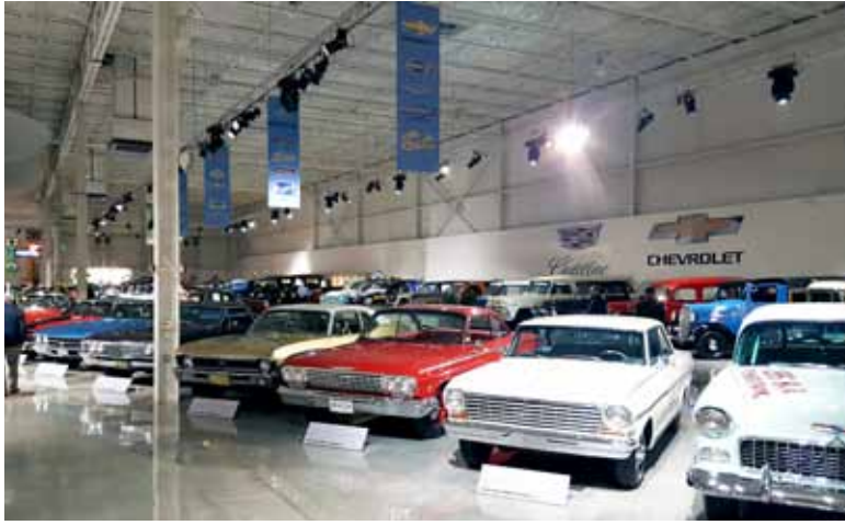
GM Heritage Collection is pretty amazing