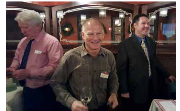
Curly, Larry, & Moe