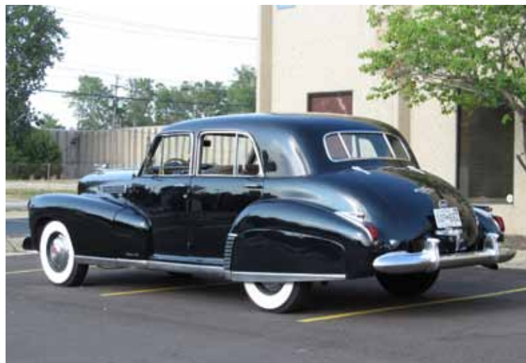
1941 Cadillac 60 Special