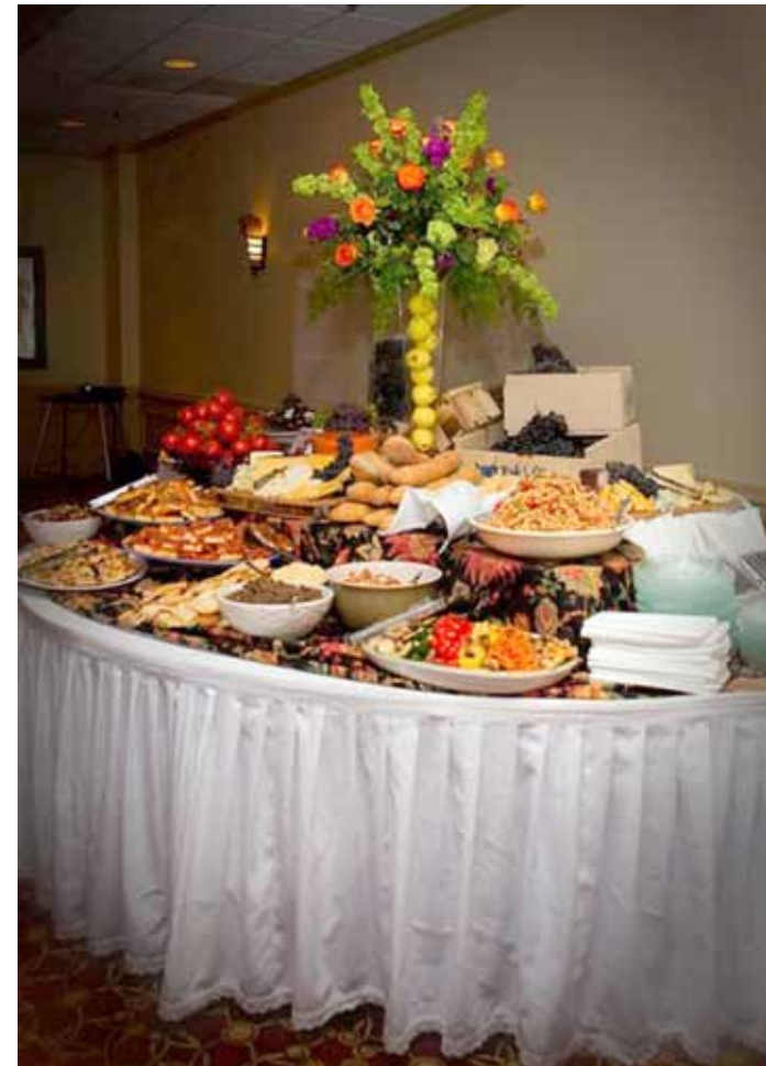
More than 50 ORCCCA members joined the festivities