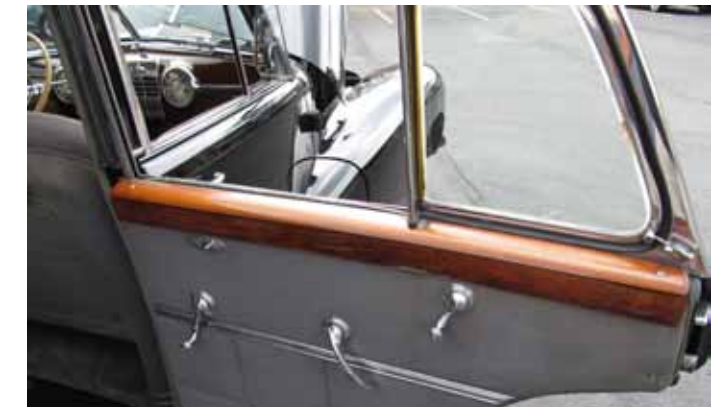
Cadillac's luxurious Fleetwood interior uses real walnut window trim

Under the skin, the 60 Special is the same as any other 1941 Cadillac save for the limousines. That means a 126-inch wheelbase, a 150 horsepower 346 cubic inch flathead V8, and a familiar "tombstone" grille up front that was shared across the line. For the first time, the headlights were merged into the front fenders and front