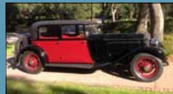
1931 Rolls-Royce Phantom II Continental

www.VintageMotorCarsUSA.com 5040 Richmond Road Bedford Heights, OH 44146 Lee Wolff 216.496.9492