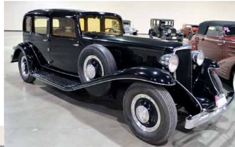
The Crawford Museum brought this one-off 1932 Peerless V16 built entirely of aluminum

Saturday was the Grand Classic, which featured sixteen-cylinder automobiles as its theme. In addition to the nineteen Cadillacs and Marmons on display, the Crawford Auto-Aviation Museum brought the 1932 Peerless V16 prototype, only the third marque to build a sixteen-cylinder automobile. Other display-only automobiles included a stunning 1934 Cadillac V16 convertible coupe by Fleetwood and the only