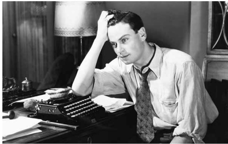
Don't let this be you when it comes to writing for your club's magazine—I can help!

ORCCCA's sole rule right now is that if someone hosts an event, they're expected to write it up, and that's a good rule. Don't worry if you're not a writer, I will happily work with your words to make sure that it looks and sounds professional—don't let the tyranny of the