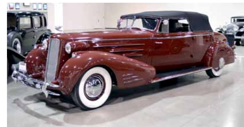
21-foot-long 1934 Cadillac V16 convertible victoria