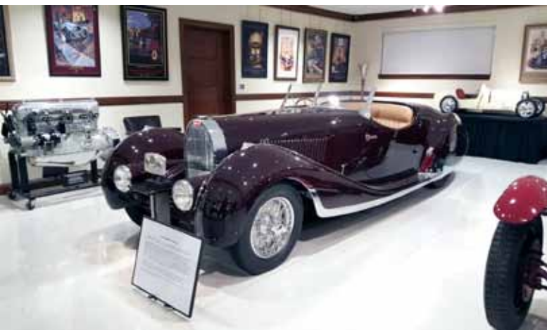
The museum-like atmosphere of the Adderley collection

Dinner that evening, which also included an awards presentation, was at the General Motors Heritage Center, which is essentially GM's private car collection.