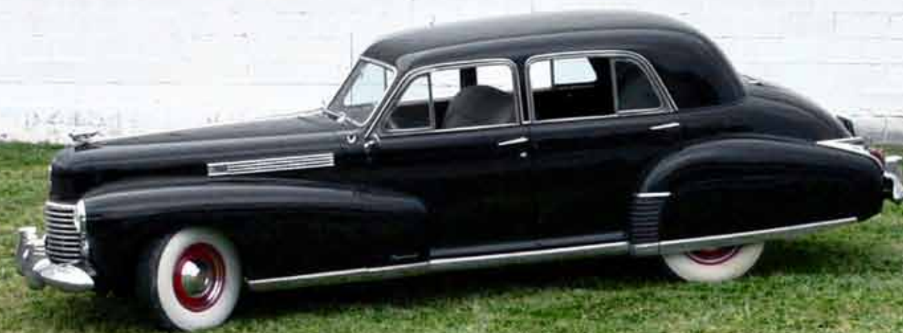
1941 Cadillac 60 Special Owners: The Harwood Family