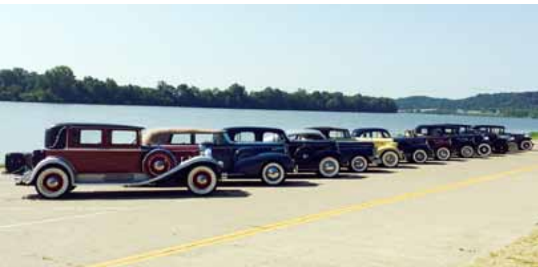
Beautiful cars, incredible scenery

Our first stop was the Henderson Hall Plantation in Williamstown, WV. The current magnificent Italianate house has been in the Henderson family since 1859. Every receipt, down to the purchase of grass seed has been kept. The age of the farm implements and household operating items still in working condition just staggered the mind and the docents were outstanding. This estate began with George Washington recommending that his good