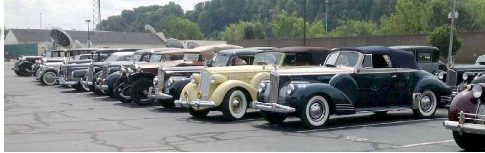
Full Classics at the Blennerhassett Museum

The adventure began on a Thursday, August 27, 2015 at 4 o'clock in the afternoon in the lobby of the historic Lafayette Hotel in Marietta, OH.