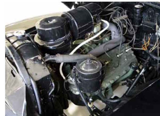
Reliable and smooth, Cadillac's flathead V8 and Hydra-Matic powered tanks during WWII

No question about it, the Cadillac is faster, but that shouldn't be a surprise. It's more than 500 pounds lighter than the Buick and the Hydra-Matic enjoys the benefits of both a lower first gear and the torque multiplication of the fluid coupling (also known as a torque converter). It really steps off smartly, making the most of the 346 cubic inch V8's 283 pounds of torque. The 1-2 shift is firm and you feel it, but it's a reassuring kind of firmness that says the transmission is trying to minimize wear and tear as it goes about its business. It's in third for only a second or two, then it drops into high at about 20 MPH. It accelerates easily with traffic, needing nothing more from the driver than a fingertip guiding the wheel. Imagine the impact such technology must have made on