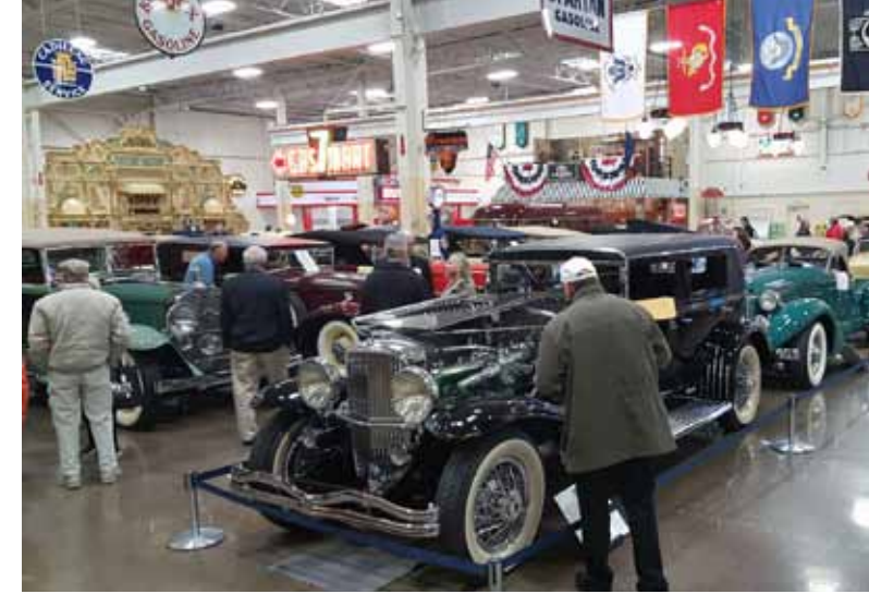
A glimpse of the extraordinary Stahl Collection

Following the board meetings, the Michigan Region