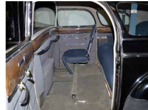
Buick Limited offers jump seats to increase seating capacity to seven (note divider window)

The leather upholstery is comfortable and supportive thanks to the rather recent restoration and all the materials and patterns are quite correct. There is some argument that the dashboard should be woodgrained instead of black, but factory engineering documents indicate that the limousines didn't get the handsome dash treatment because it was for the chauffeur's eyes only. The large plastic steering wheel makes even this giant car easy to handle and it's nice to see that Buick treated the driver to the same wonderfully ornate engine-turned