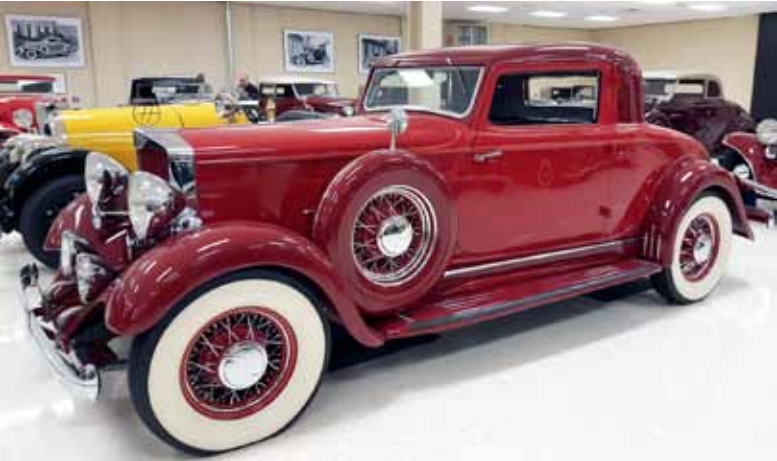
Adderley's lovely and rare (1 of 1) 1932 Hupmobile coupe

area. I was particularly smitten by a handsome 1932 Hupmobile coupe that looked like a 3/4-scale Marmon Sixteen with beautiful cycle-style fenders designed by Raymond Loewy himself. A second building houses vintage race cars, wooden boats, brass automobiles, and post-war sports cars, including a quartet of Ferrari 365 GTBs, better known as the Daytona.