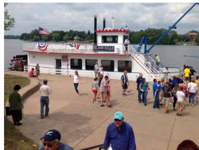
Island Belle stern-wheeler

Sunday morning we were making our way north to Blennerhassett Island, which is off Parkersburg, WV. The route was a little known national historic road along the river. The vistas coming around many of the bends were worth the entire trip. It was a beautiful sunny morning. We arrived in time to tour the museum and to watch a video on the reconstruction of the mansion. We then hurried to catch the boat to the Island. Many enjoyed the horse drawn tour of the island and we all appreciated the tour of the historic house and its recreated grounds.