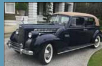
1940 Packard Super Eight 180 Formal Sedan