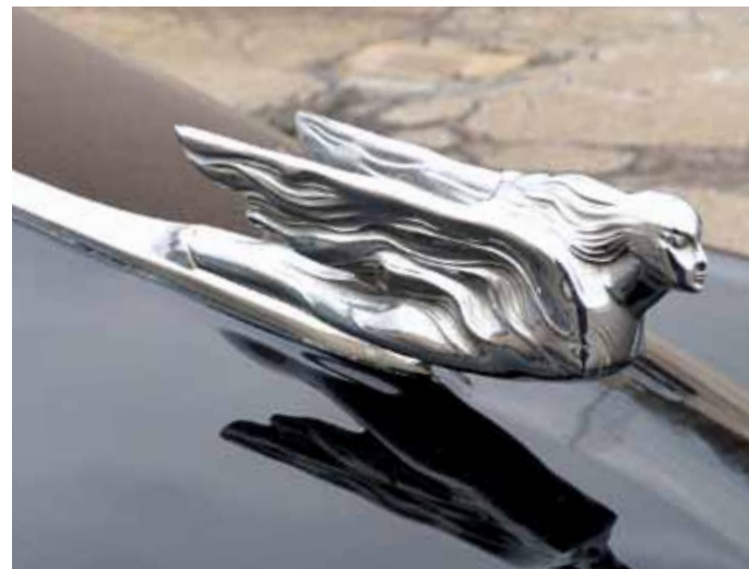
Cadillac has a more traditional "flying lady" hood ornament that doubles as hood latch

The Cadillac is smaller than the Buick, but not by a lot and unless you've got the mammoth Buick sitting next to it, you will surely consider the 60 Special a very big car. However, its proportions hide that size quite well and it looks simply gorgeous from any angle; I am particularly fond of the rear three-quarter view that shows off the fender lines and the three-pane rear window. Designed for owner/drivers, getting behind the wheel is easy and there's a wide range of adjustment in the seat for just about anybody, plus plenty of headroom despite the low