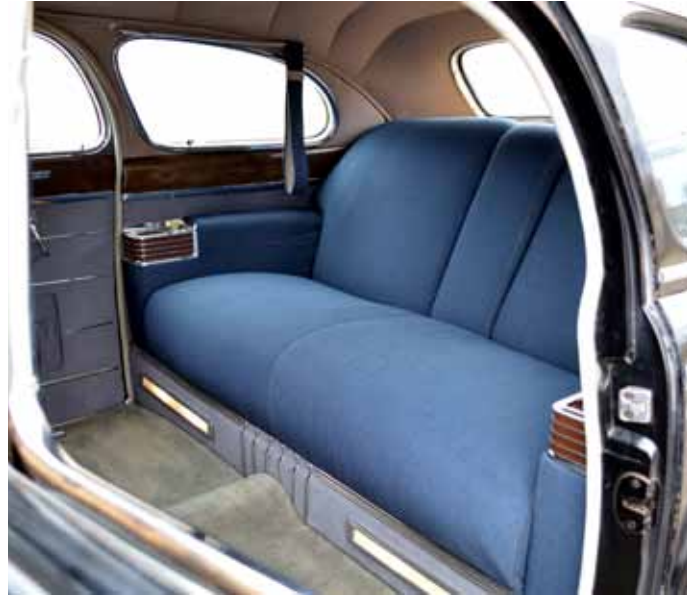
The Limited's cavernous rear seat was compared to first-class train travel in period advertising

like it was moving even when it was standing still. It was powered by the domestic auto industry's most powerful production engine: Buick's 320 cubic inch OHV straight-8, which made 165 horsepower thanks