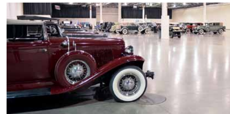
The show field

trip each year. Next year, the Annual Meeting will be in Reno, Nevada, so it'll be a great excuse to escape the winter weather for a few days. See you there! 🚗