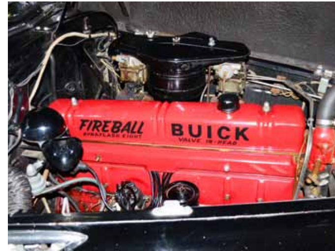
Buick's unique side-opening hood gives good access to the dual carb straight-8

four corners that are almost 20% larger than those fitted to lesser Buicks. If anything, the Limited does its best to hide its mass and mostly succeeds, but with the laws of physics being what they are, you just can't expect it to be as nimble as a smaller car.