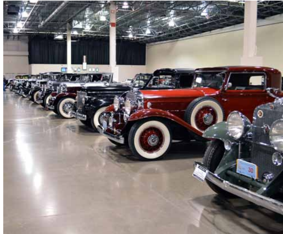
About half of the "Sweet Sixteen" vehicles on display

The Novi Convention Center was an obvious choice for an event like this, especially one with a Grand Classic as part of the festivities. With outstanding hotel facilities, a banquet hall, and a giant display area for three times as many Classics as we had in attendance, the mechanics of the show were well-oiled. We were allowed to unload our trailer Thursday night and get the car situated for the Grand Classic on Saturday, then we hurried downtown for the North American International Auto Show (NAIAS) at Cobo Hall. For car enthusiasts, this is the pre-eminent auto show in the US, the show where all the domestic auto makers introduce their latest and greatest and pull out all the stops to showcase the very best hardware in