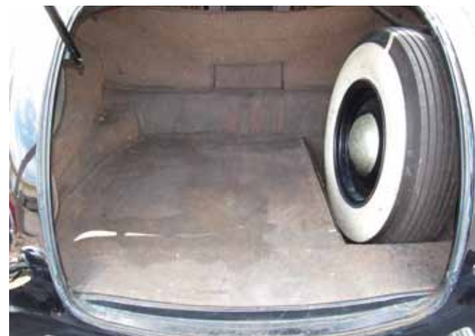
Both cars offer good trunk space for touring, with a slight advantage to the Cadillac (right). Spare tires eat a lot of space in both cars.