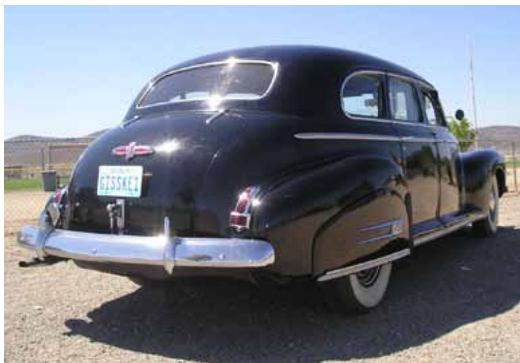
1941 Buick Limited