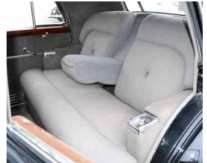
Cadillac's cozy back seat is ideal for two