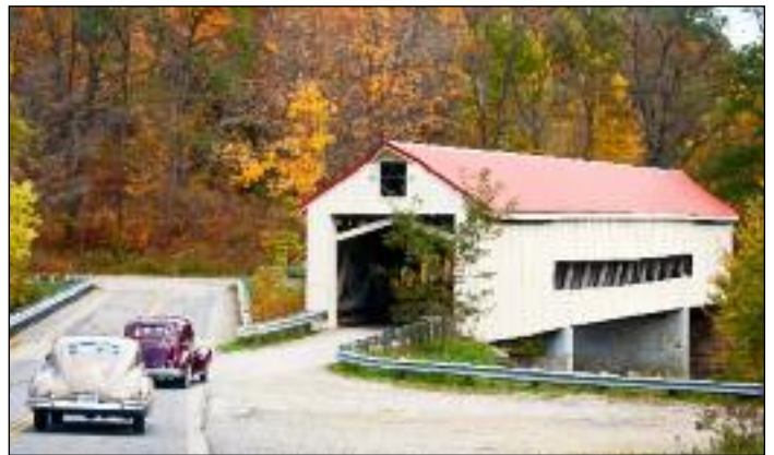
Mechanics Road Bridge, 154 feet, 1867