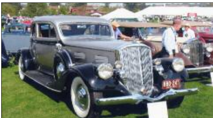
1934 Pierce Arrow