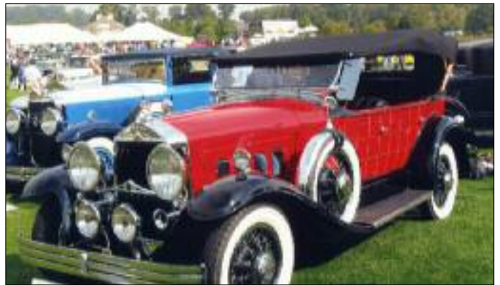
1930 Willys-Knight Plaid Side