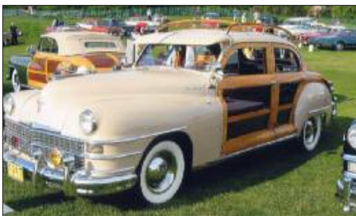
1948 Chrysler Town and Country