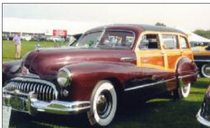
1947 Buick Roadmaster