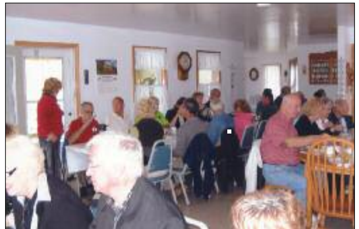
Lots of room!