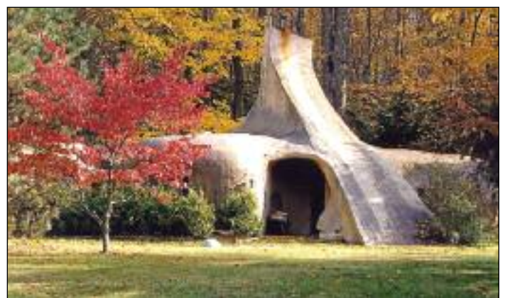
Very strange house. Early caveman?