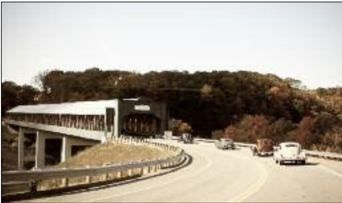
Smollen-Gulf Bridge in Ashtabula. Longest (613 feet) and newest (2008) covered bridge