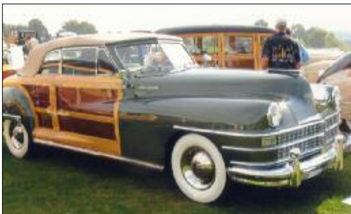
1948 Chrysler Town and Country