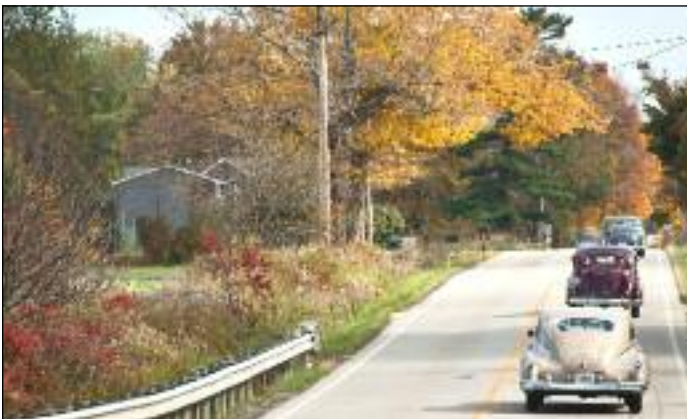
Back roads, old cars, and Fall colors