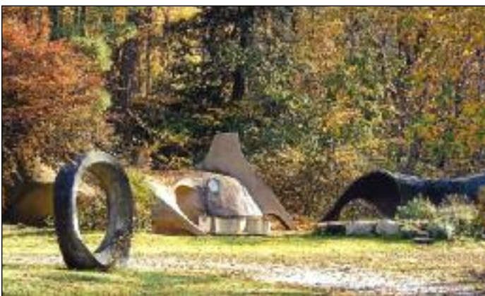
Unusual contemporary home in woods