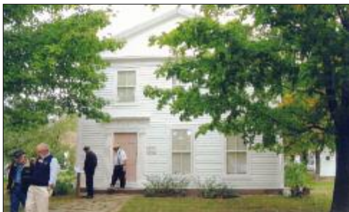
Home and Military Museum at Burton Village