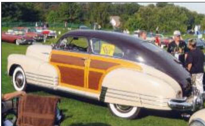
1948 Chevrolet "Country Club"