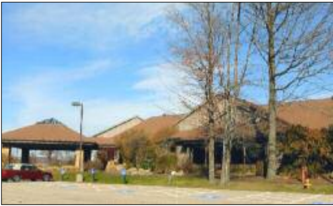
Rosemont Country Club - Akron