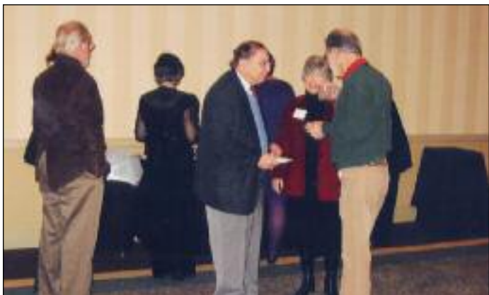
Greeting old friends