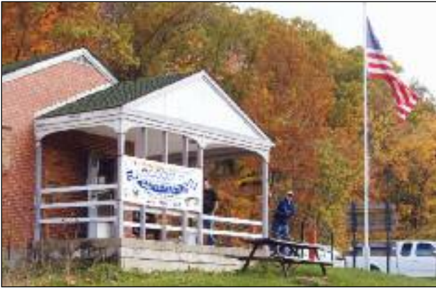
Small store and facilities at Harpersfield Bridge