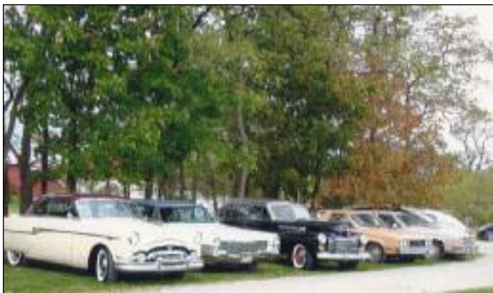
Parking at "Emma's"