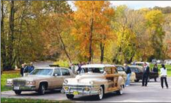
Stop for pictures at Harpersfield Bridge