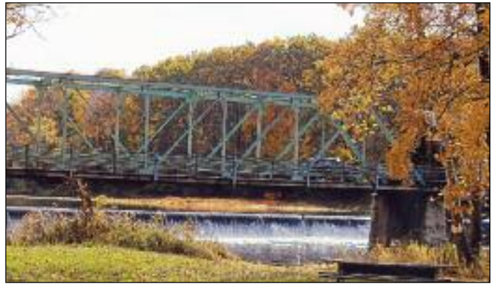
Crossing metal bridge and falls