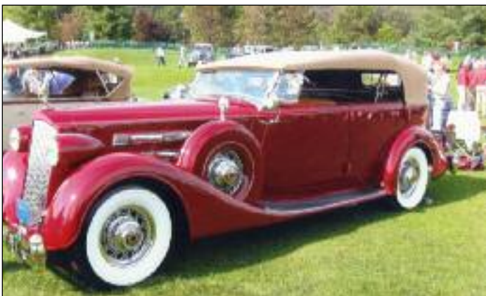
1936 Packard 12