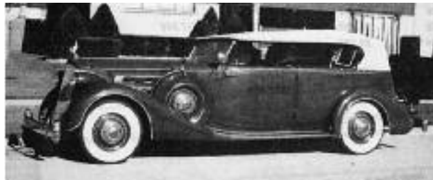
The Cadillac was sold to purchase this 1935 Packard V-12 dual-cowl phaeton once owned by Robert Hall McCormick.

You can imagine how great it was to be able to drive a 1938 Cadillac Series 90 convertible coupe with an automatic transmission behind its V-16, plus power steering. I'll never forget the unusual feeling that it brought to mind. It just made everything seem weird, but in a very enjoyable way.