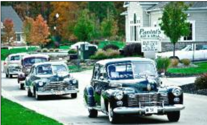
On the move