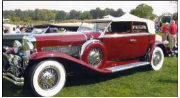
1929 Duesenberg - Murphy Body