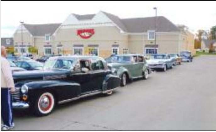
Gathering at Plaza at I-90 and Rt. 44