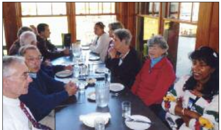
Members and guests from three clubs enjoying the meal and company.