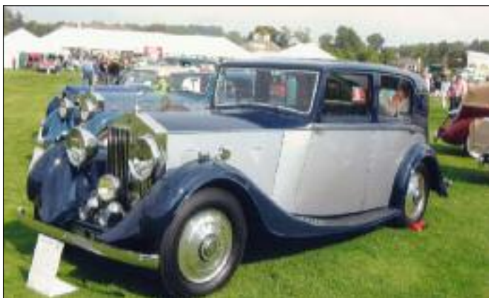
1935 Rolls Royce