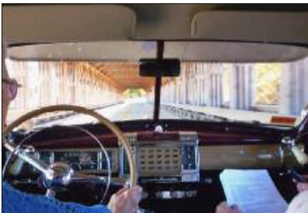
Going through Smollen-Gulf Bridge