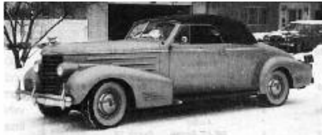
This 1938 Cadillac Series 90 convertible coupe was fitted with power steering and an automatic transmission behind its original flathead V-16 engine by the GM Tech Center for the car's original owner.

largest private shareholders of General Motors stock and several years ago, I had a stroke, which precluded me from using my right arm. I was able to prevail on the powers that be at the General Motors Tech Center and they were only too anxious to convert my very favorite car to an automatic transmission with power steering. I've been driving the car like that ever since, but now I'm nearing my 90th birthday and my doctor tells me that I shouldn't be driving anymore. Take it out for a ride and see how you like it. I think I'd like to have a young man like you have the car."