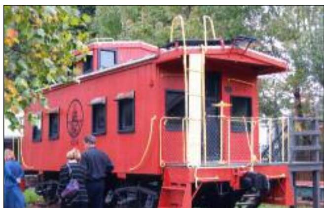
Caboose at Depot