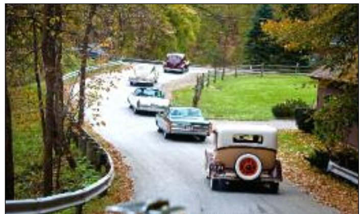
Don't miss the left turn!