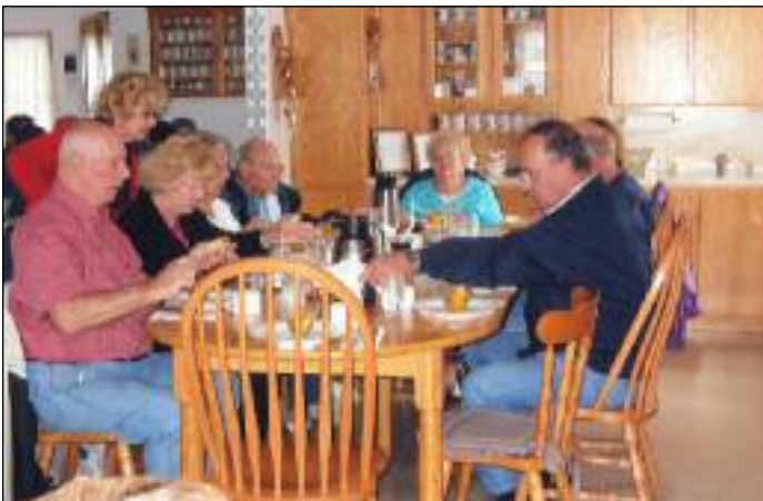
Sturdy Amish chairs