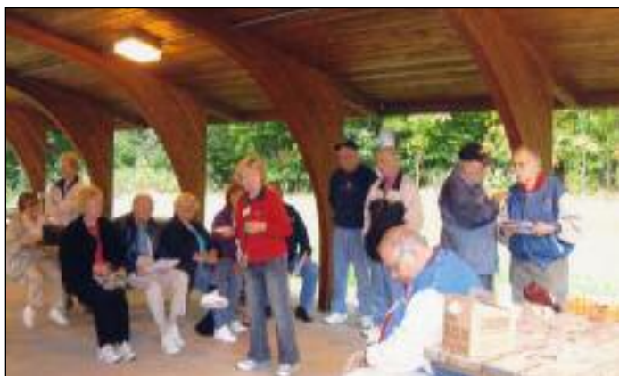
Gathering at West Woods Park in Geauga County for donuts and coffee