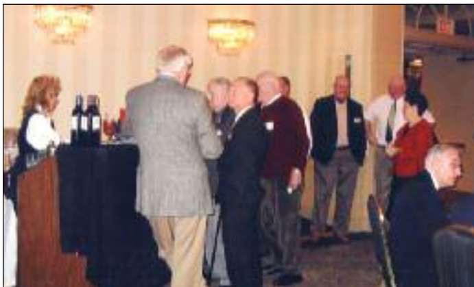
Line-up at the Bar