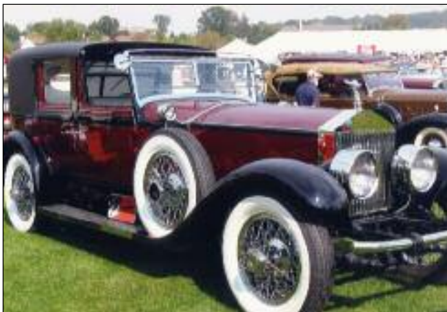
1928 Rolls Royce Town Car