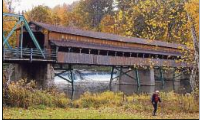
Harpersfield Bridge and Falls - 228 feet long, built in 1868, upgraded 1992