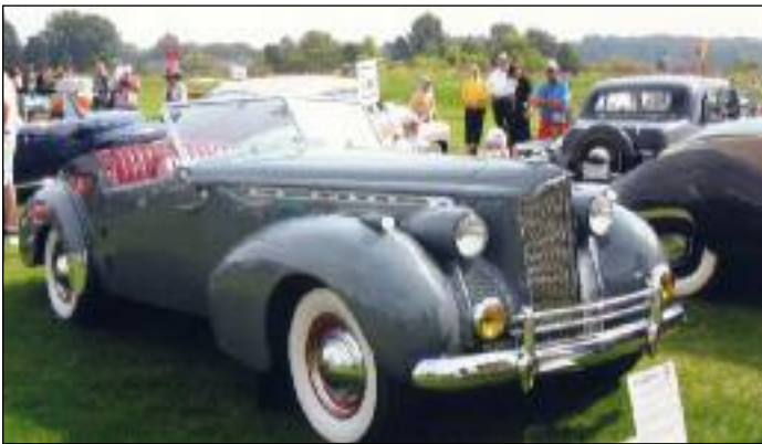
1939 Packard Darrin