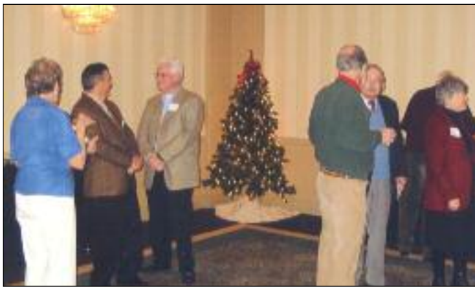
Conversation at the Christmas tree