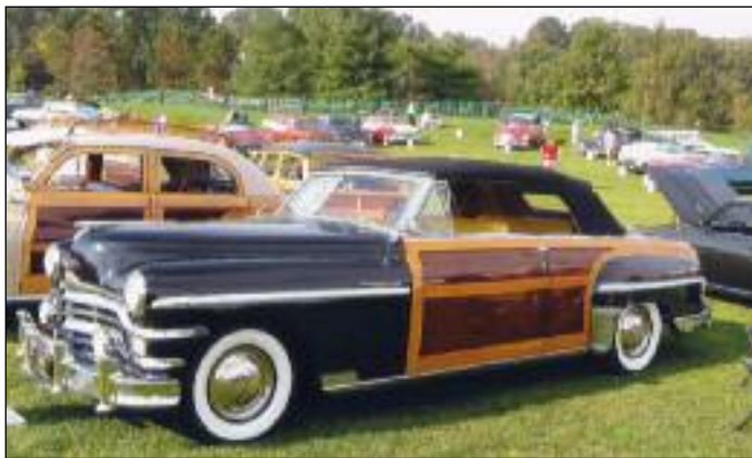
1949 Chrysler Town and Country