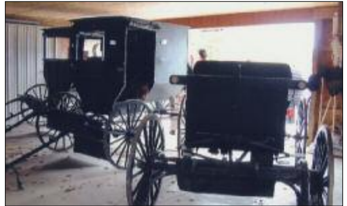
No cars here!