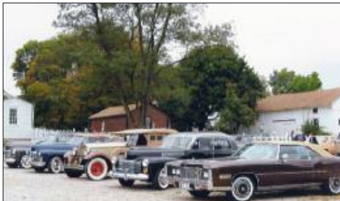
Parking at Burton Village - 4 Cadillacs and a Packard