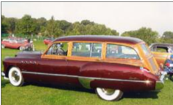
1941 Buick Roadmaster