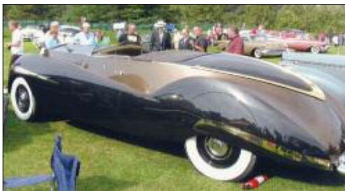
1939/47 Custom Bodied Rolls Royce