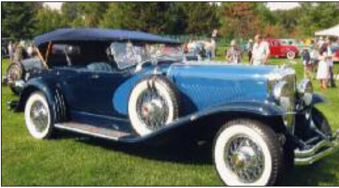
1929 Duesenberg - LeBaron Body